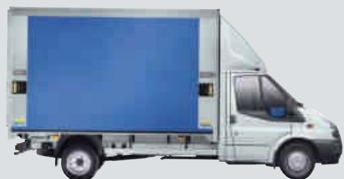
3.6m/11ft 9in 350 LWB - optional equipment shown