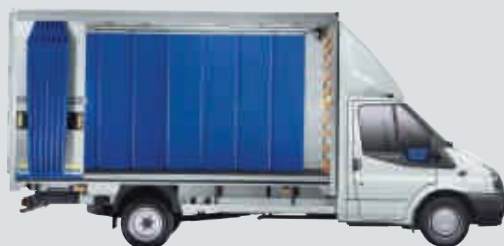
4.0m/13ft 350 EF - optional equipment shown

The new Transit CurtainSlider represents the latest in bodywork design, giving unparalleled load access with innovative and practical features to ease everyday operating tasks. Sliding, semi rigid curtains provide a neat, attractive solution for pallet loads used in the Distribution and Just-in-Time industries, where productivity and load turn-around are critical.