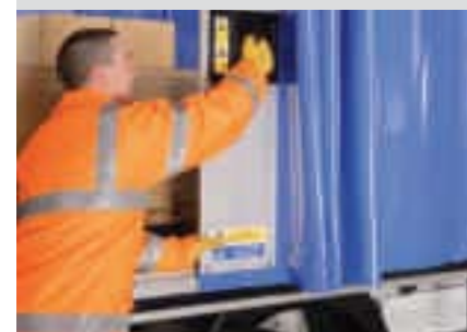
Optional bulkhead load-loc rail and additional lath's, 6 fitted as standard