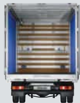
Optional internal equipment shown